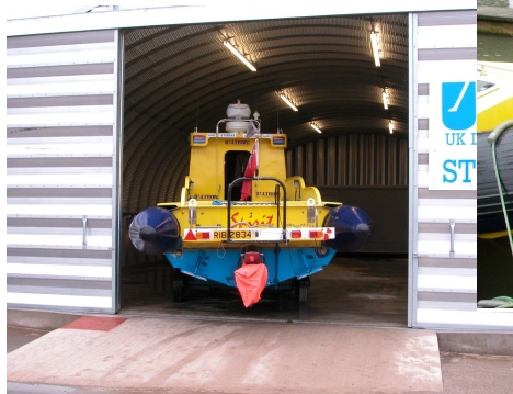
Spirit about to come out of her shed in Cardiff Docks.

And even at this stage of the game, there were still last-minute deals to be done with sponsors. The arrangement with the South Wales Echo came quite late in the day, providing us with a very useful