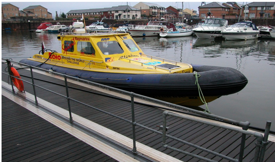
Spirit of Cardiff in Penarth Marina.